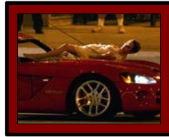
PRODUCT PLACEMENT & INTEGRATION